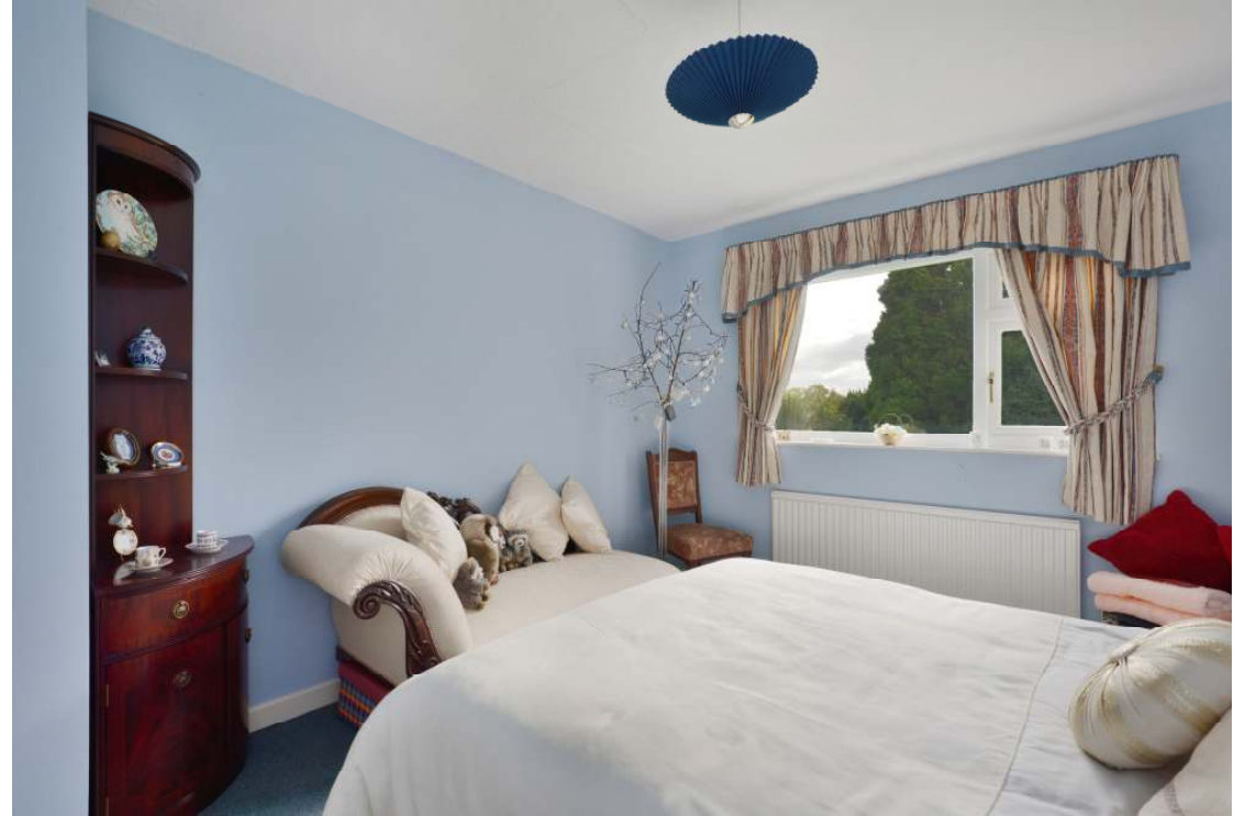
Three good sized bedrooms with supporting bathroom