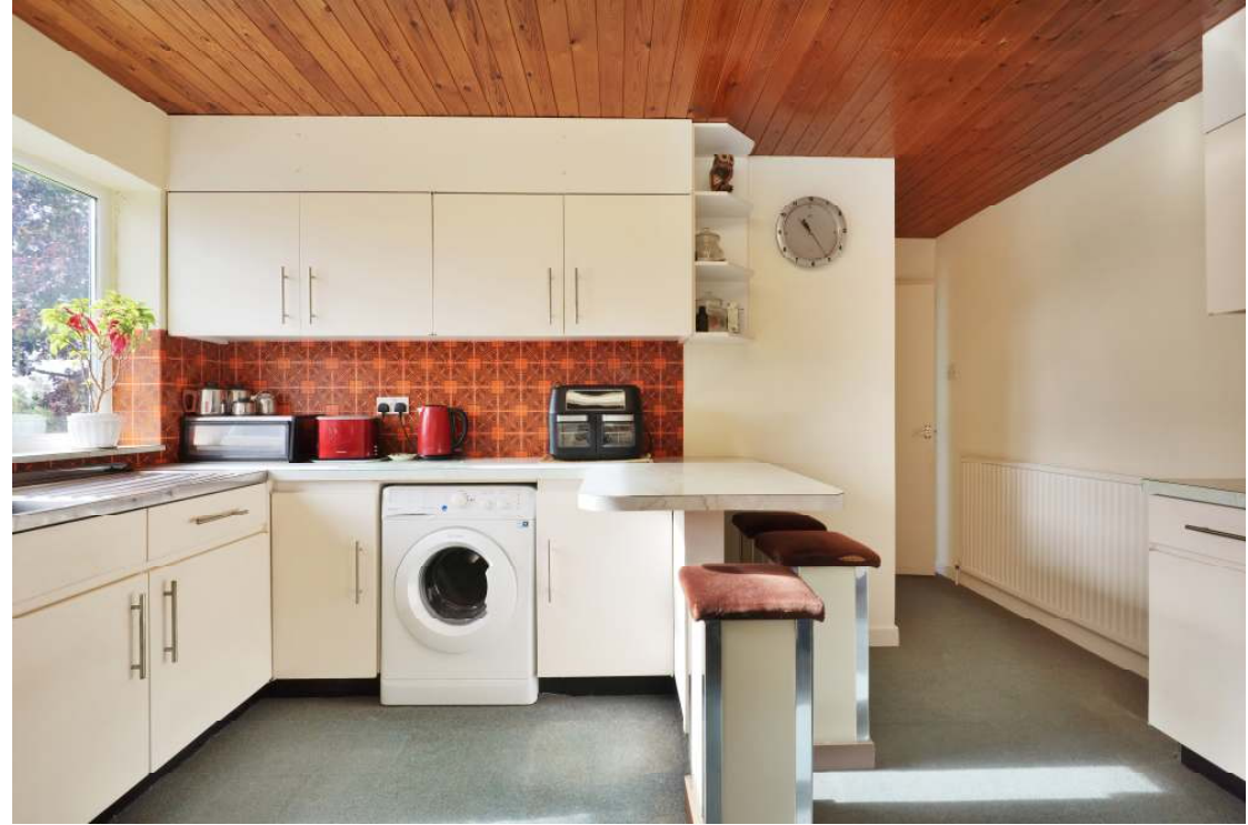
Entrance hall / kitchen / living room / dining room